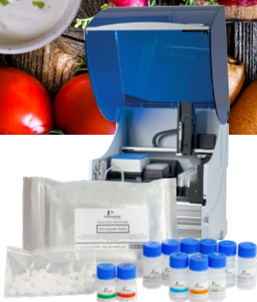
Solus One Salmonella Assay and Automated Workflow Package