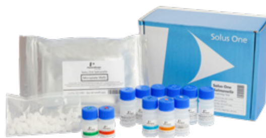
Solus One Salmonella

Use Solus One Salmonella to test the most challenging matrices using simple enrichment protocol variations.